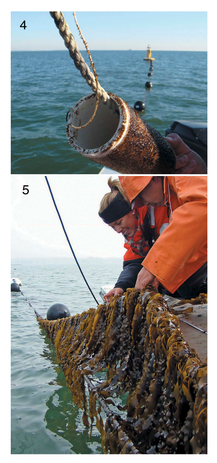
Figs 4, 5 Saccharina latissima farms in Long Island Sound. Fig. 4. Kelp outplanting using seed spool on longlines. Fig. 5. Saccharina latissima grown at Long Island Sound, Connecticut.

Kelp aquaculture is one of the fastest growing industries in the northeastern United States. Success of the industry in the Northeast is attributed to (1) the development of suitable aquaculture technologies specifically for operating in US waters, (2) strong domestic markets, and (3) strong support from coastal