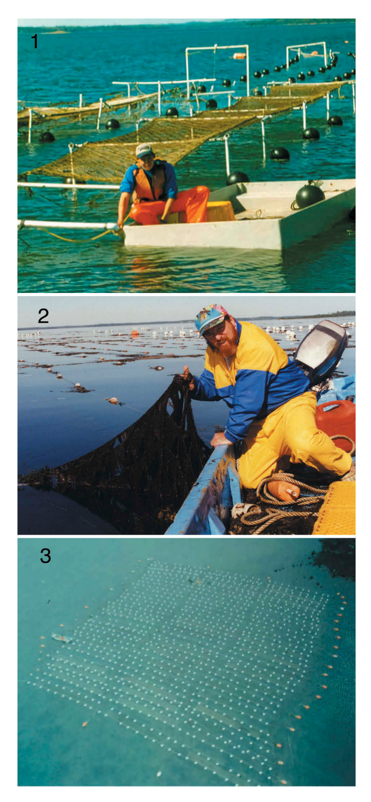
Figs 1–3. Pyropia yezoensis farm at Eastport, Maine. Fig. 1. Ikada nursery system. Fig. 2. Production farm.

Fig. 3. Aerial view of the Pyropia farm.