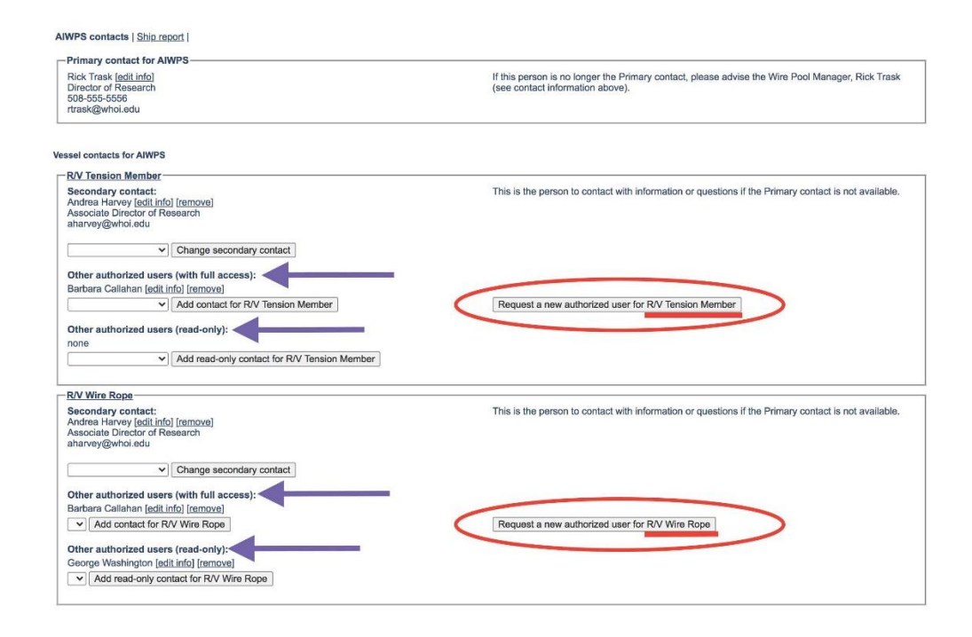
Figure 2: Requesting a new authorized user and assigning their level of access

The next step is dependent on the Database Administrator approving the new contact and may take a day or two for this to occur. Once the contact has been approved, the Primary or Secondary contact can assign the level of access they want that person to have. To do so go to Edit contact list . This takes you back to the page shown in Figure 2. For each vessel, if there is more than one, there is a pull-down list under the title Other authorized contacts (with full access): and another pull down list under the title Other authorized contacts (read-only). These are identified in Figure 2 with the purple arrows. Both pull down boxes should have the name of the contact(s) you requested be added as an authorized user (if it was approved by the Database Administrator). If you want the new contact to have full access use the lower box. Select the person's name from the pull-down menu and click on the corresponding button to the right of their name indicating that you want to add them as a contact. Having done so the new contact and their level of access is listed on the UNOLS WIRE POOL SHIP REPORT page.