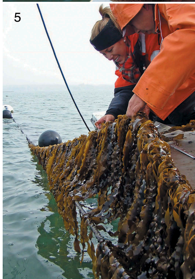
Figs 4, 5 Saccharina latissima farms in Long Island Sound.

Fig. 4. Kelp outplanting using seed spool on longlines.