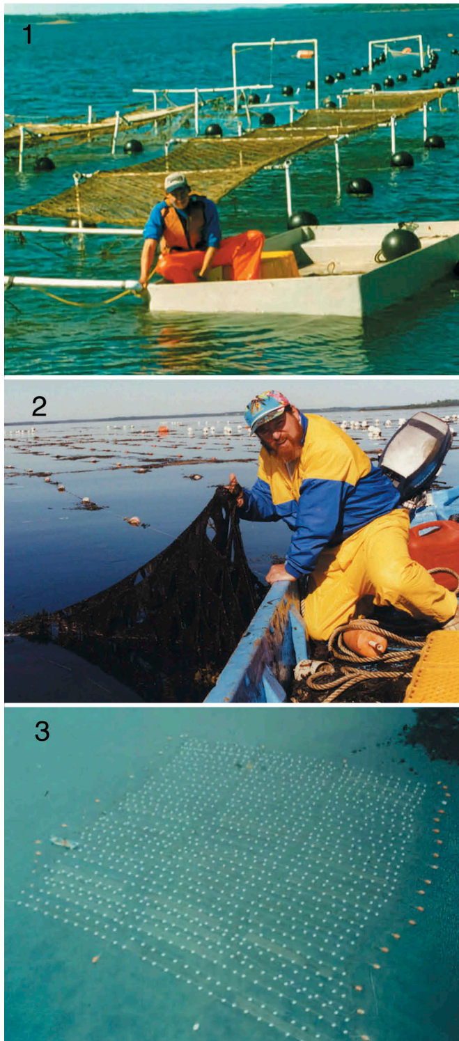
Figs 1–3. Pyropia yezoensis farm at Eastport, Maine. Fig. 1. Ikada nursery system. Fig. 2. Production farm. Fig. 3. Aerial view of the Pyropia farm.

conchospores were seeded onto 16 standard Pyropia nets (1.5 × 18 m) and eight small nets (2.0 × 2.5 m). Four seeded standard Pyropia nets were then transferred to a site in western Long Island Sound (Bridgeport, Connecticut) for nursery culture. After 43 days, blades grew up to 1.5 cm in length, thereby establishing the effectiveness of ‘free-living’ conchocelis