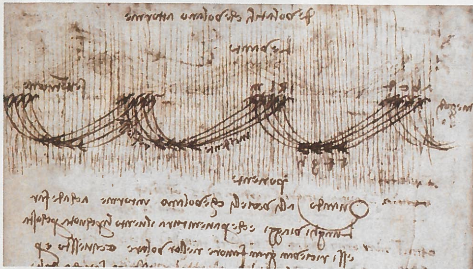
FIGURE 2. ACROSS-WIND dynamic soaring, as illustrated by Leonardo da Vinci in the early 1500s. The nearly straight vertical lines indicate the direction of the horizontal wind, which is blowing from top to bottom in the figure. Reading from right to left, the first phase of the birds' motion involves an ascent that has components out of the plane of the page and against the flow of the wind. The ensuing descent is partially with the wind. The wind direction and the details of the maneuver are described in Leonardo's notes, written in his characteristic reversed, right-to-left style.

In 1900 Rayleigh summarized bird soaring as part of a review of the mechanical principles of flight. It was an important review, because at the time Rayleigh was one of the few respected scientists to promote human flight. His work included an examination of dynamic soaring of albatrosses and other seabirds. It also had discussions of soaring in wind gusts, soaring in updrafts of warm air currents, and the phenomenon of wind striking sloping land and being deflected upwards.