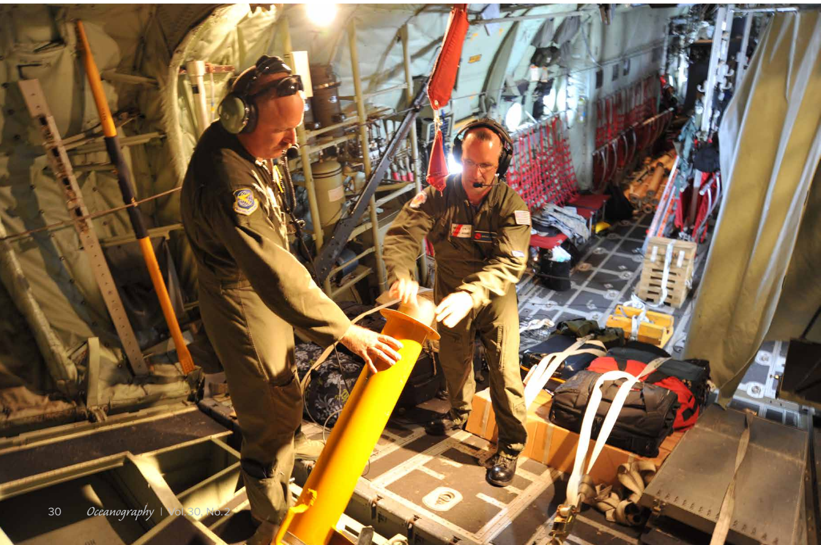
FIGURE 2. (below) An ALAMO being loaded into the launch tube of a Hurricane Hunter C-130J. (left) An ALAMO after deployment from a NOAA Twin Otter.

ALAMO floats have been air-deployed in polar seas as well. Considerable effort was invested in the design and implementation of an ice-avoidance scheme. Profiling floats must surface to report their data and provide position information. Sea ice makes this difficult and hazardous for floats, as a float on the surface can easily be